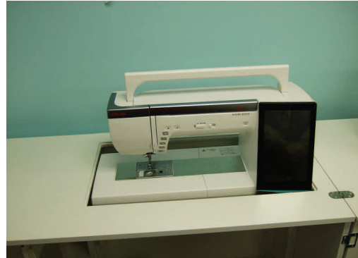
Janome 15,000 fits the cabinet opening in flatbed position. In this picture, we have not removed the accessory kit.