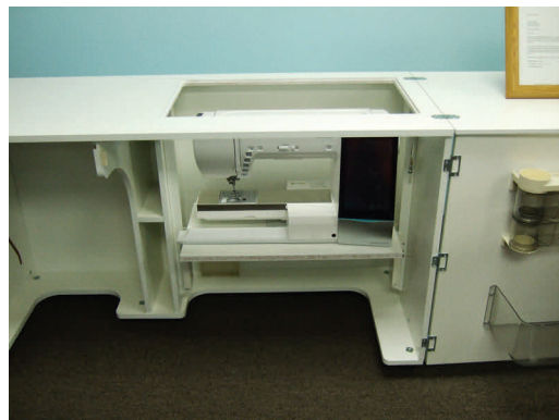
Machine fits fine in storage position.