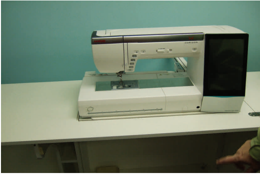
Janome 15,000 on Aussie Cabinet platform. Knee lifter lever cannot be used. Lift supports the weight of machine.