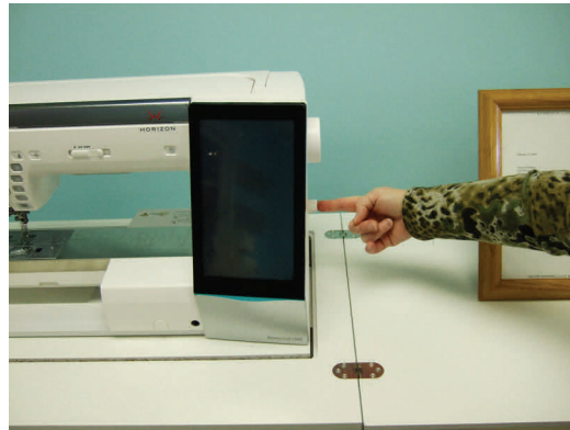
Note that when the right side of the sewing machine base is at the right edge of platform, the differential control knob and hand wheel extend further to the right than opening allows. Cords not plugged in. Push down on machine and platform to lower unit slowly. When you hear a click and stop in flatbed to reposition the machine to the left as shown next.