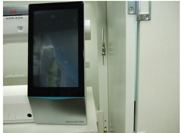
In Storage, right side of machine

To bring machine back up from storage, you will engage the lift by pushing on machine and platform through the cabinet opening. The lift normally moves from the bottom all the way up to the top – Storage to Free Arm. Keep your hands on the machine to control and stop the platform when it clicks at the second position Flatbed. Push the platform down to lock so you can slide the machine leg back onto the platform.