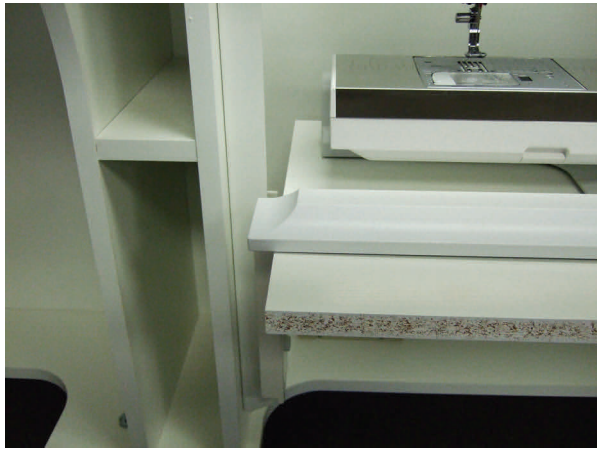
In Storage, left side of machine