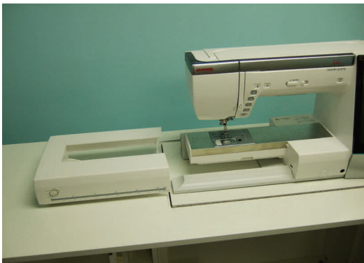
Janome 15,000 in freearm position, top of cabinet showing how to remove the accessory kit for best fit on platform. Custom made, machine specific acrylic insert is available as optional accessory.