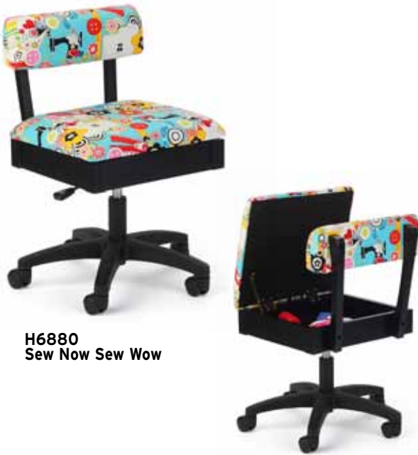
H6880 Sew Now Sew Wow

You've chosen your ideal sewing cabinet, now design your ultimate sewing studio experience! Your workspace is a reflection of who you are, and Arrow offers high quality storage solutions and chairs that not only enhance your sewing experience but also the aesthetics of your sewing room.