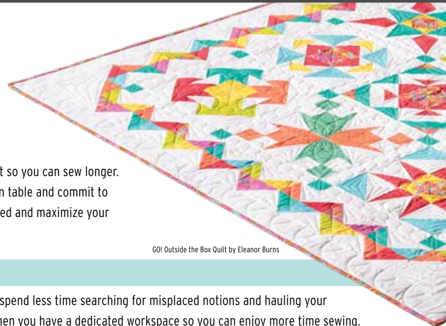
GO! Outside the Box Quilt by Eleanor Burns