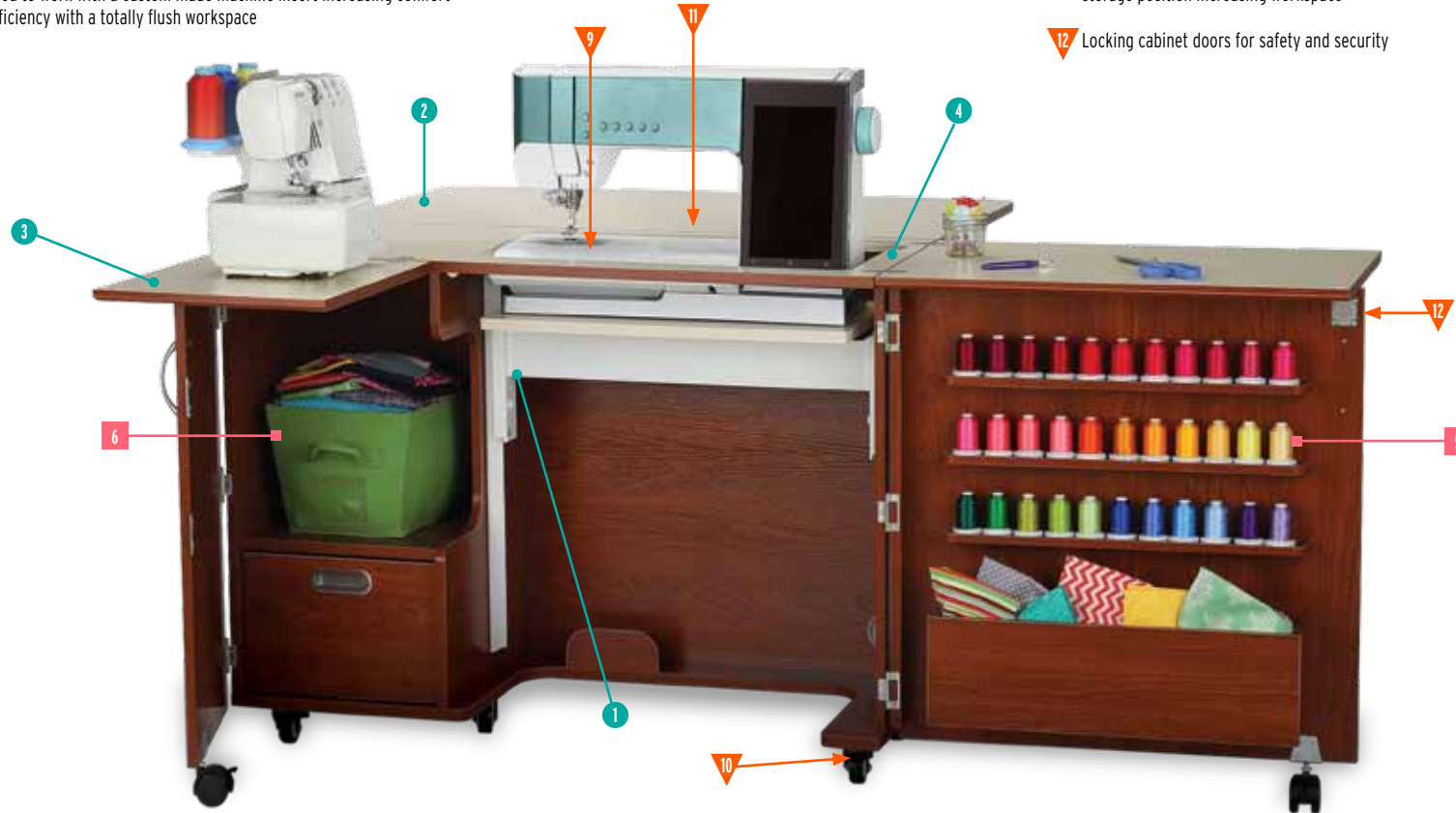
Wallaby II Cabinet