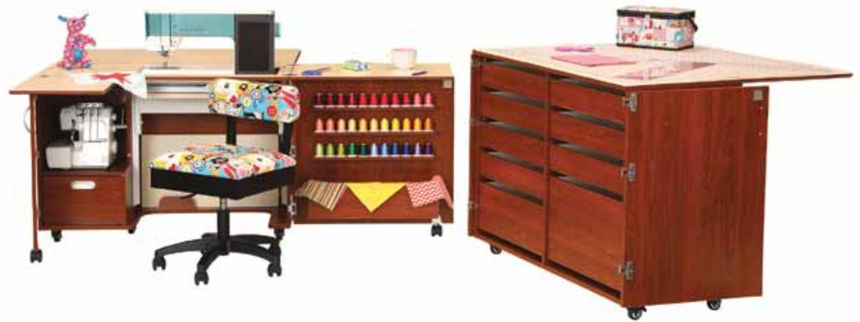
Wallaby II & Dingo II Studio Set with Sew Now Sew Wow Adjustable Height Chair